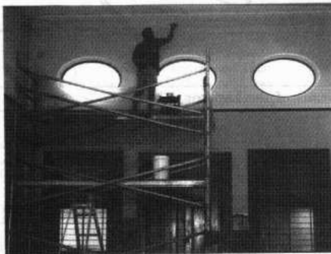
The Instrument Room during restoration.